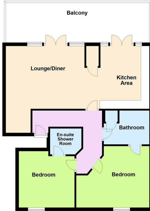
Total area: approx. 75.7 sq. metres (814.9 sq. feet)